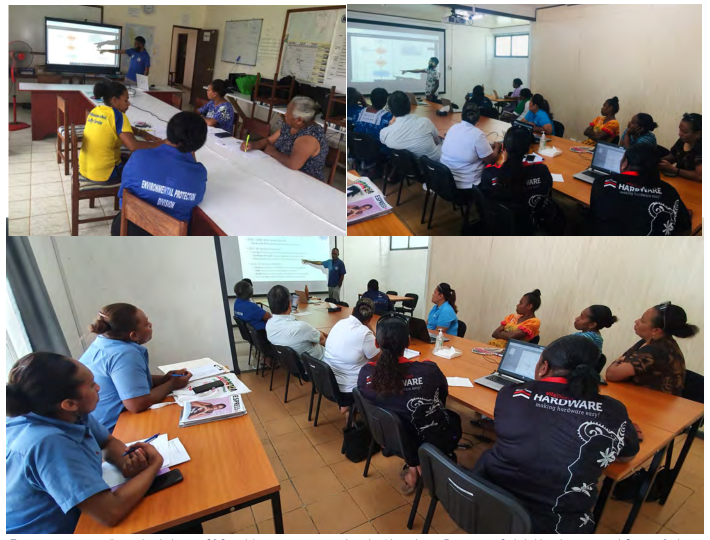
To ensure users are well versed with the new ODS module, trainings were conducted in November to Environment Stakeholders, Importers and Customs Brokers, prior to the launching of the module. The trainings were conducted by the National Ozone Unit Officers and the Single Window Project team in both Luganville and Port Vila. The introduction of the ODS module now meant a further increase to the number of entities and individuals currently using the Single Window System in Vanuatu.