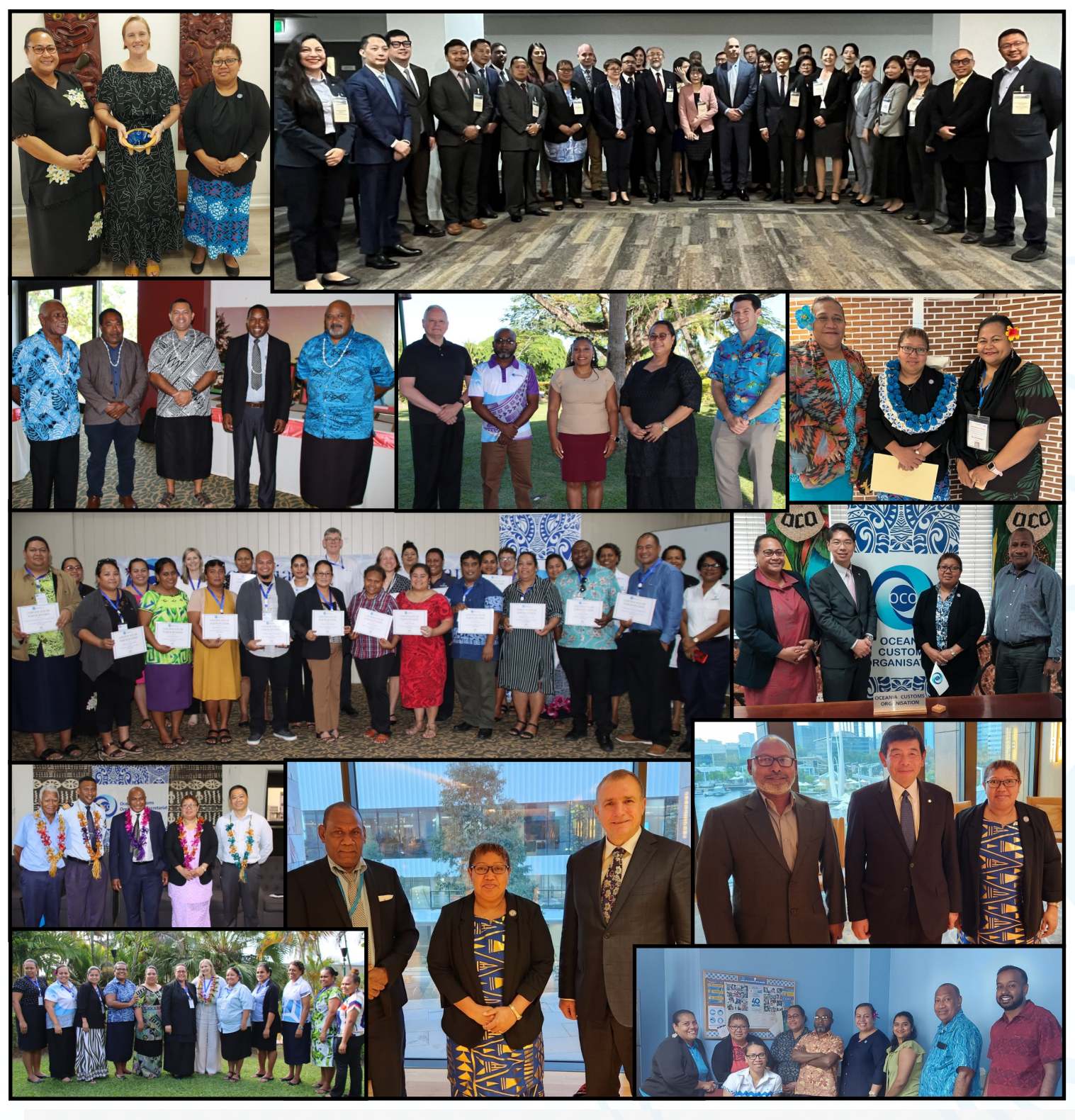
Oceania Customs Organization